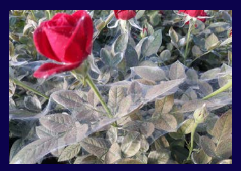
Two spot spider mite