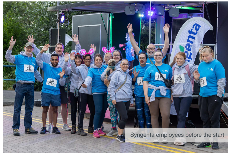
Syngenta employees before the start