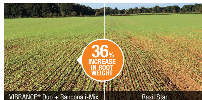
Brandon, Suffolk sandy loam (over chalk) soil, SY THUNDERBOLT hybrid winter barley drilled 18/09/20. Picture taken 09/10/20 and rooting assessed 15/03/21.