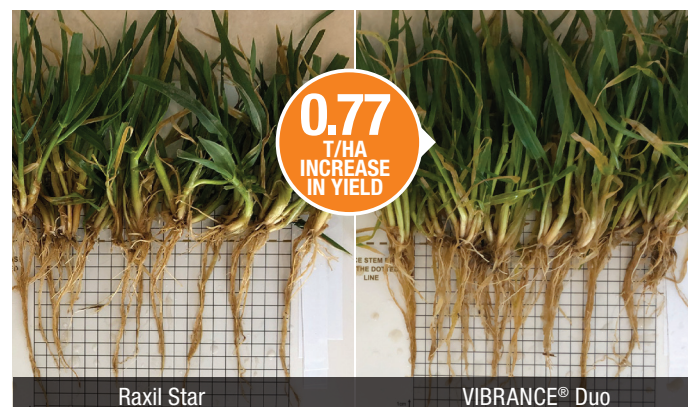
VIBRANCE® Duo 36% increase in rooting and 65% increase in foliage over Raxil Star. Berwick, SY KINGSBARN winter barley drilled 12 th Sep 2019. Assessed 19 th Mar 2020.