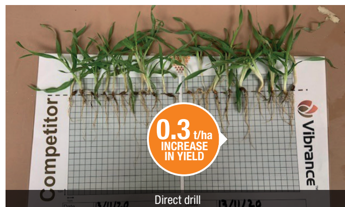
Rougham, Suffolk. Medium soil. SY KINGSBARN hybrid winter barley drilled 1st October 2020. VIBRANCE® Duo + Rancona i-MIX versus Raxil Star assessed late November 2020.