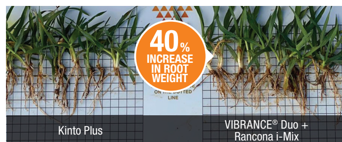
Shropshire, light soil, SY KINGSBARN hybrid winter barley, drilled early Oct. Assessed 2 nd Mar 2021.